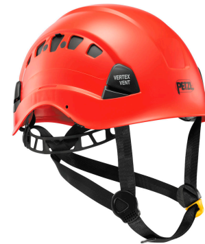
PERSONAL SAFETY HELMET

Innovative harness for high ropes courses and adventure parks. Easy-to-use, uncomplicated design