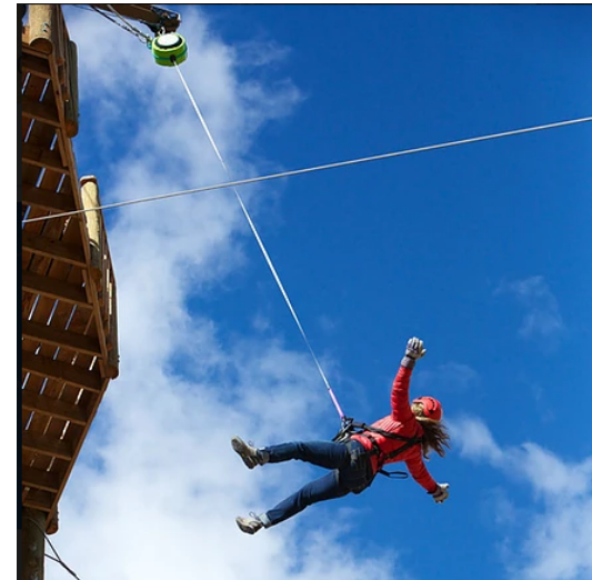
Free Fall Jump