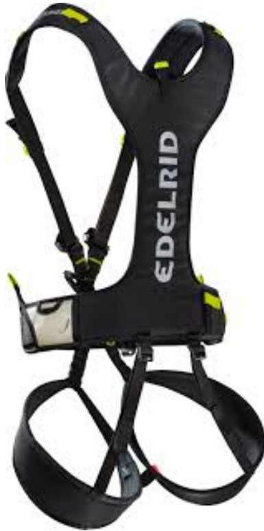
FULL BODY HARNESS

Innovative harness for high ropes courses and adventure parks. Easy-to-use, uncomplicated design